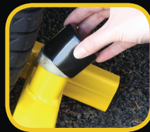
Fig 6: Securing The Clamp

Push the two arms as close together as possible and insert the lock assembly into the barrel housing on top of the front arm. Note: It may be necessary to move the assembly from side to side in order to achieve the best fit, which may not necessarily be with the arms resting on the ground.