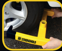
Fig 4: Front Arm Location

Place the rear arm behind the right side of the wheel rim as you face it and position the long 'nose' so it rests as close as possible to the spoke gaps in the rim. Note: It may be necessary to angle the arm to achieve this.