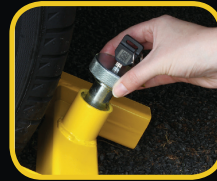
Fig 5: Fitting The Lock

Holding the rear arm in one hand, offer up the front arm so that its square central tube slides over that of the rear arm and the short front arm 'nose' comes to rest in the recess at the edge of the rim, or in one of the spoke gaps.