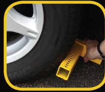
Fig 3: Rear Arm Location

Place the rear arm behind the right side of the wheel rim as you face it and position the long 'nose' so it rests as close as possible to the spoke gaps in the rim. Note: It may be necessary to angle the arm to achieve this.